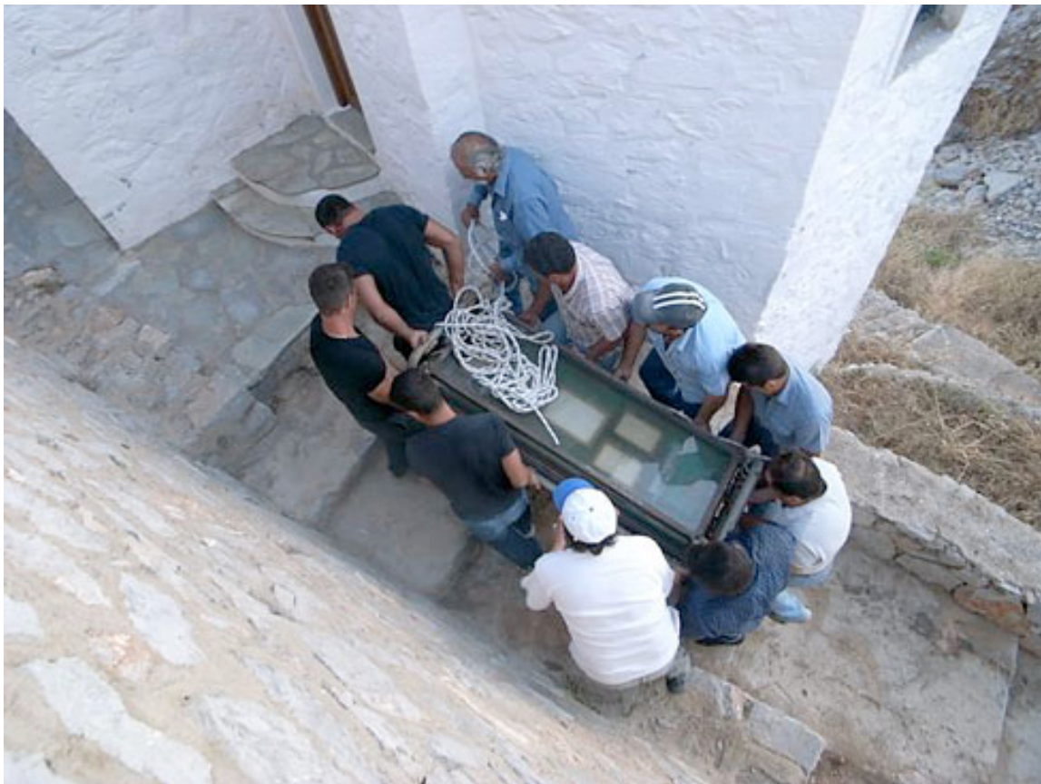
The mysterious artifacts and artworks.

A night of mayhem followed at the Pirate club, a local favorite, leaving art trekkers with very few hours to sleep before the artwork delivery, at 6 a.m. At dawn, the crowd waited patiently on a winding cliffside road, where little by little the local psaras (fishermen) pulled out of the water an expected glass sarcophagus containing mysterious artifacts and artworks. The long pace of the unloading echoed the calm, focused and attentively observant crowd who were clearly intended to be part of the artwork, part of an imaginary film Matthew Barney unfolded in front of our eyes.